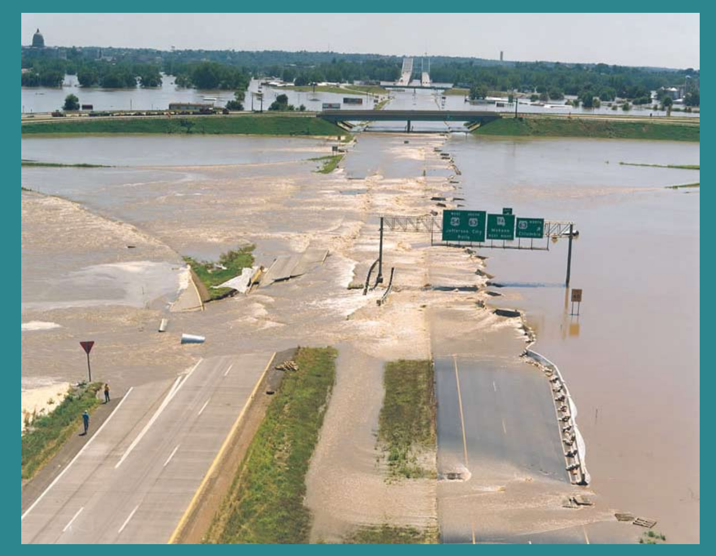
The Great Flood of 1993 caused flooding along 500 miles of the Mississippi and Missouri river systems. The photo shows the flood's effects on U.S. Highway 54, just north of Jefferson City, Missouri.