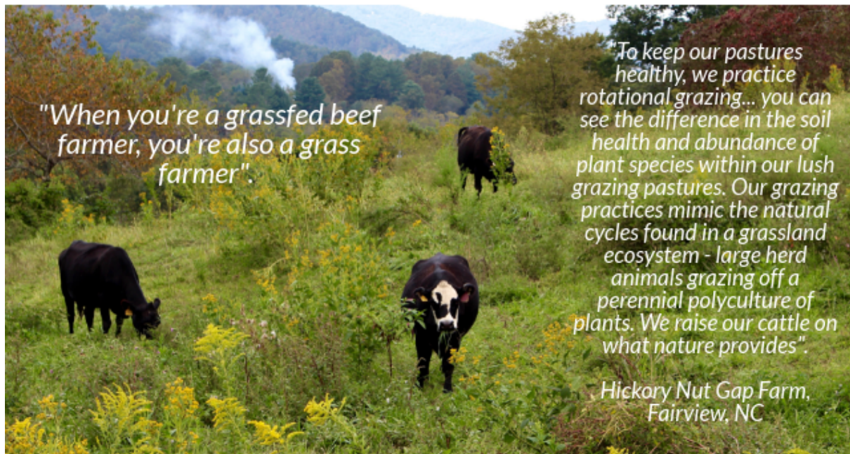
Image 2: Cattle grazing at Hickory Nut Gap Farm in North Carolina. The common sentiment among ranchers interviewed for this study is that they are grass farmers first and cattle ranchers second, as raising cattle is contingent on maintaining the health and integrity of the pastures.

Drought poses a grave threat to animal grazing systems. Prolonged periods of reduced precipitation, particularly in the spring months, combined with above average temperatures impact the quantity and quality of forage and reduce the availability of water resources. Furthermore, drought conditions can cause heat stress to animals as well as limit their conception rates and ability to gain weight (Takahashi, 2012). If plant growth is affected by drought, livestock tend to selectively graze the highest-quality forage first, and the overall forage quality will decline. Reduced forage quantity and quality during drought is much more pronounced than during an average growing season (Scasta et al. 2016).