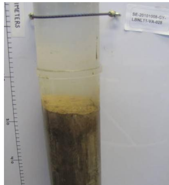
Internal Diameter of Core: 10 cms