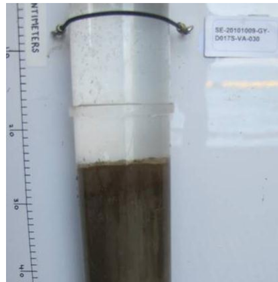
Internal Diameter of Core: 10 cms