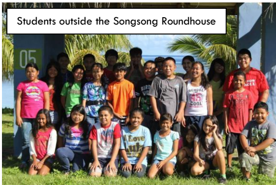
Students outside the Songsong Roundhouse

The three stations were as follows: learning about and snorkeling in Sasanhaya Bay Reserve (though due to rough water the snorkeling activities were moved to Teteto Beach for the second two days); participating in the ongoing revegetation project in Talakhaya; and the third station included multiple stops: a discussion of marine debris and coastal threats with CRM at Teteto Beach, bird watching at I Chenchon Bird Sanctuary, as well as a presentation from the Brown Tree Snake program, and finally learning about sustainable farming practices on Mr. Hocog's farm.