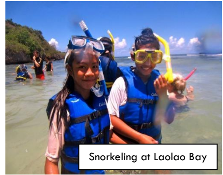
Snorkeling at Laolao Bay

About 18 4-5 th grade students participated in the Saipan Ridge to Reef Eco-Camp / Reef Rangers camp. This camp was coordinated in conjunction with the rangers of American Memorial Park (AMP). DEQ's involvement in this camp was as the lead coordinator for orchestrating the various presenters and themes for each day. DEQ spent $500 to provide buses for a one-day field trip to the Laolao Bay watershed. Students were bused from AMP to DEQ's revegetation site, then hiked down Gapgap Road to witness first-hand the erosion caused by unpaved roads, and finally hiked down to a snorkel site at