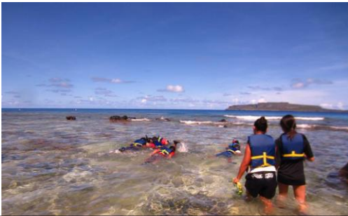
Snorkeling at Sasanhaya Bay Marine Protected Area