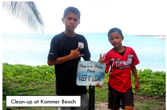
Clean-up at Kammer Beach