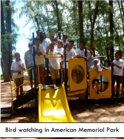
Bird watching in American Memorial Park

About 18 4-5 th grade students participated in the Saipan Ridge to Reef Eco-Camp / Reef Rangers camp. This camp was coordinated in conjunction with the rangers of American Memorial Park (AMP). DEQ's involvement in this camp was as the lead coordinator for orchestrating the various presenters and themes for each day. DEQ spent $500 to provide buses for a one-day field trip to the Laolao Bay watershed. Students were bused from AMP to DEQ's revegetation site, then hiked down Gapgap Road to witness first-hand the erosion caused by unpaved roads, and finally hiked down to a snorkel site at