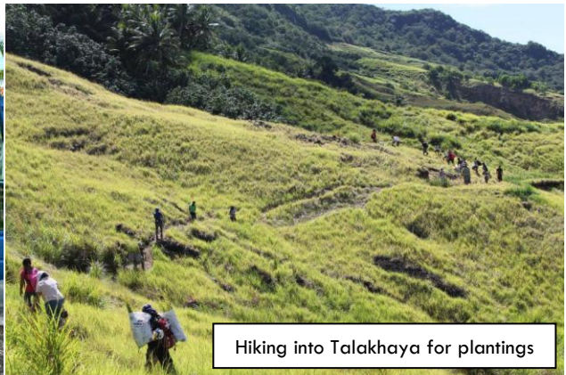
Hiking into Talakhaya for plantings