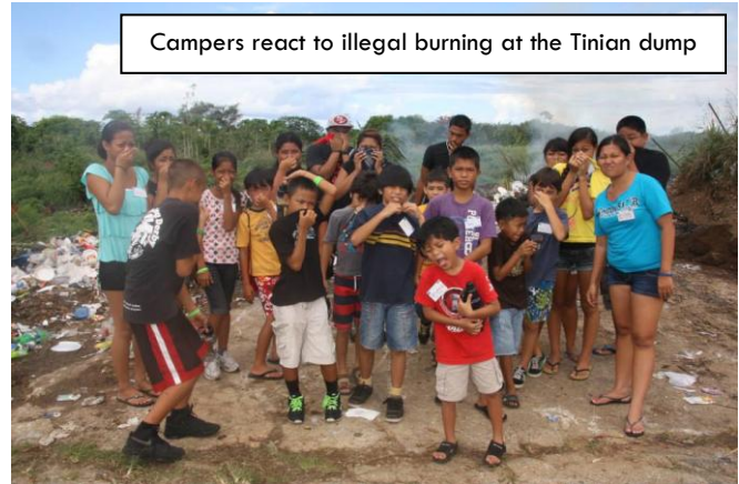
Campers react to illegal burning at the Tinian dump