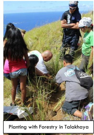
Planting with Forestry in Talakhaya

Finally, though they are mentioned in the 'Thank You's' below, the Rota Ridge to Reef camp could not have happened without the support of Rota Department of Public Safety. DPS helped to transport campers to and from the activity sites, but more importantly they insured campers' health and safety, particularly during the various snorkeling events. For a full schedule of the Rota camp please see Appendix II .