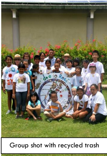
Group shot with recycled trash

All other financial investments (t-shirts, boat trip to Managaha, various printed materials etc.) were either donated by partner/presenting agencies or by American Memorial Park and their partner, Pacific Historic Parks. The rangers and NPS staff coordinated the various activities and projects not conducted by the