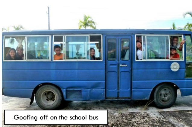
Goofing off on the school bus

Talakhaya Revegetation Project Volunteers