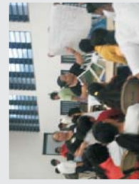
Mormon Church Youth