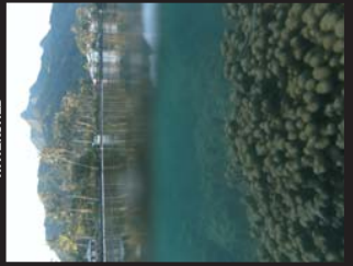
LAGOON AND REEF AREA WITHIN WATERSHED