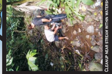
CLEANUP NEAR STREAM WITHIN WATERSHED