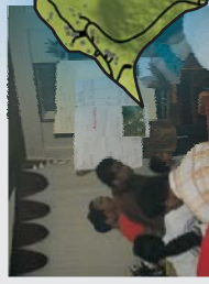
AOG Church Youth