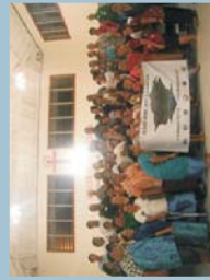
Methodist Church Youth