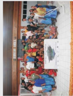
Catholic Church Youth