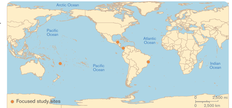
Of the four countries with MMAs, 6 study sites were in Belize, 3 study sites were in Brazil, 9 study sites were in Fiji, and 1 study site was in Panama.

Currently existing indigenous peoples, often overlooked in socioeconomic research, from four countries with marine managed areas (MMAs)—Belize, Brazil, Fiji, and Panama—were selected as case studies. Three points in the cross-country analyses present themselves: 1) there is a wealth of traditional knowledge that guides customary practices which needs to be identified and integrated into the formal regime of MMAs; 2) there is an overlap between indigenous peoples and others who have lived close by for generations and shared extensively in marine resource use, thus creating an amalgam of traditional cultures; and 3) there is a growing awareness by nation-states to integrate into their own emerging national cultures the beliefs and practices found among indigenous peoples and others who share traditional cultures.