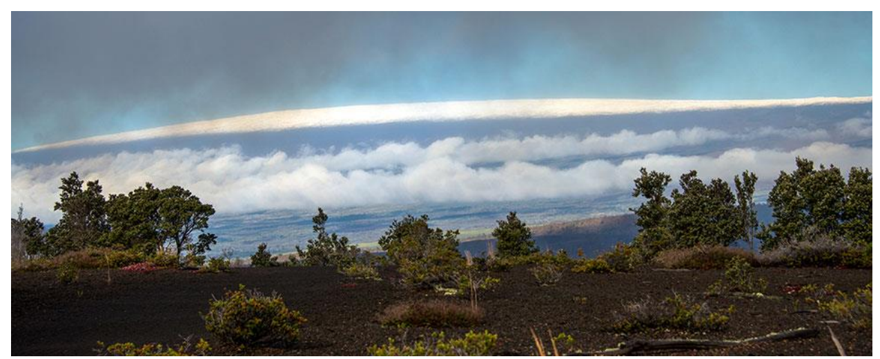
Figure 3. Snow on the summit of Mauna Loa, December 2, 2016.

Figure 2. Precipitation record from the USCRN station on Mauna Loa, December 1, 2016. The red, green, and blue lines show the progress of precipitation during the storm, while the vertical light blue bars show the accumulated amount for each 5 minute period, and the black bars indicate the time-delayed arrival of liquid water in the tipping bucket rain gauge after the snow started to melt. A total of 0.95 inches fell on calendar day December 1 from local midnight to midnight.