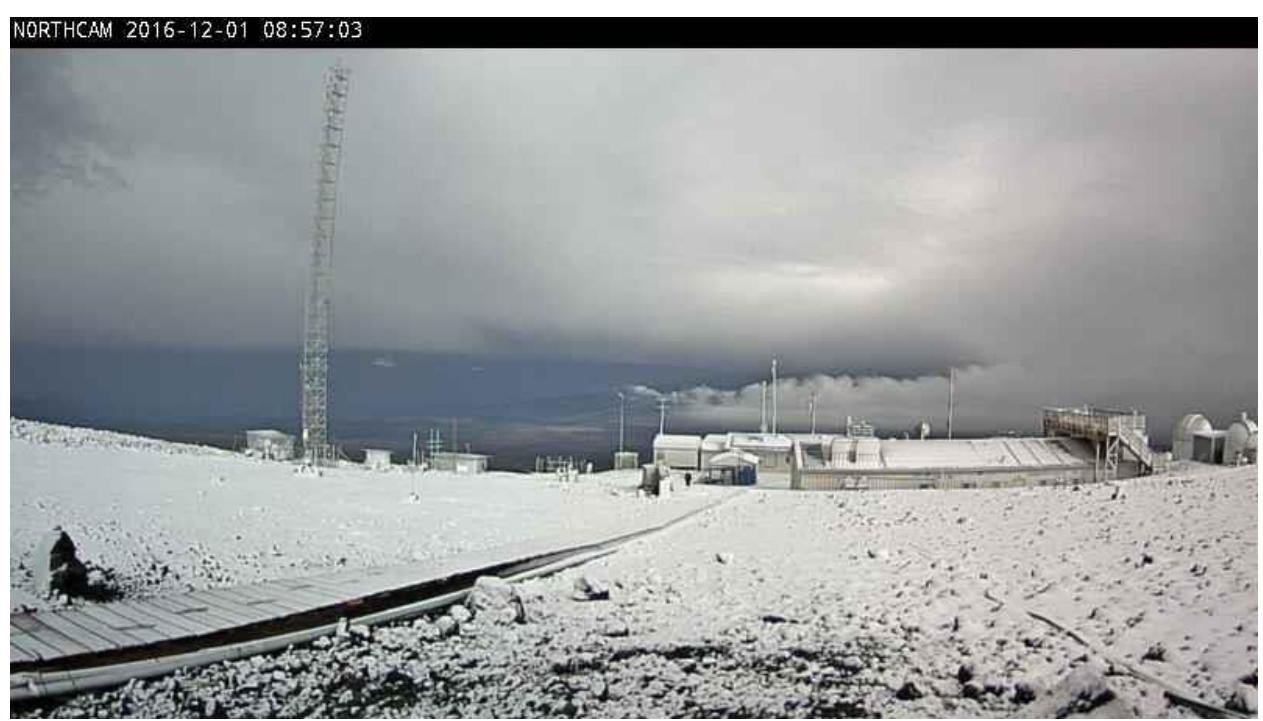
Figure 1. Picture of the snow cover on December 1, 2016 at the NOAA Mauna Loa Observatory.

The U.S. Climate Reference Network (USCRN) station at Mauna Loa is not a stranger to snow at its altitude of 11,179 feet, but the highlands of the Big Island of Hawaii experienced an unusually long period of snow from December 1-5, 2016. The initial storm on December 1 dropped snow levels down to 10,000 feet in places, and left a complete blanket of snow at the NOAA Mauna Loa Observatory (Figure 1). While the USCRN station is not pictured, the precipitation data