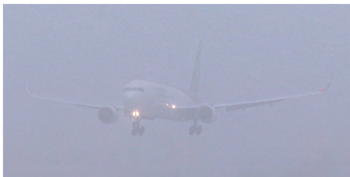
Image: UPS plane landing in fog. The ISMCS informs decision-making and helps reduce weather-related disruptions.

When considering expansion into a new hub in the Southeast, UPS used the ISMCS to compare average weather conditions at Mobile, Alabama, and Pensacola, Florida. While the airports are only 59 miles apart, they exhibit unique fog frequencies resulting in different probabilities of successful landings. Analysis with ISMCS helped UPS make important planning decisions reducing weather-related disruptions.