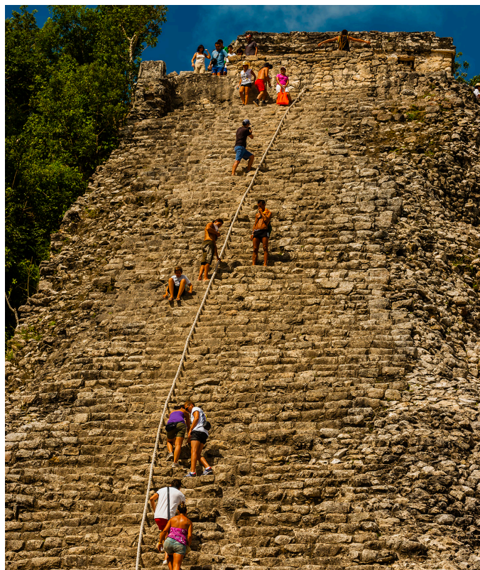
Nohoch Muul Temple, the tallest pyramid at the Coba archaeological site of Pre-Colombian Maya civilization, in the jungle near Riviera Maya, Mexico.

Another proxy for P–E is the percent of sulfur in the lake sediments. Evaporation concentrates sulfur in the lake water. If the sulfur concentration becomes high enough, salts such as gypsum (CaSO 4 ) will start to precipitate from the lake water and add sulfur to the lake sediments. The variations of sulfur percentage match the variations in oxygen isotopes closely. Corroborating one paleoclimate proxy with another is an important check on proxy records and gives us more confidence in them.